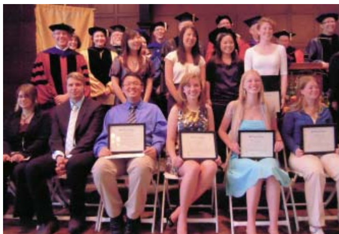
Some of the University of the Pacific students initiated to Phi Beta Kappa.