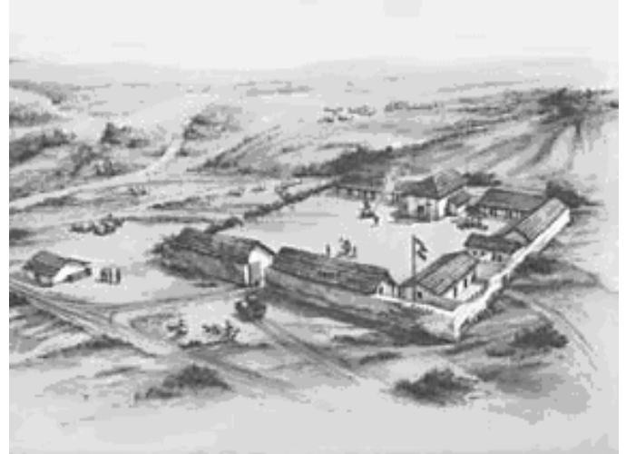
Artist's conception of Spanish Presidio of San Francisco

Historic Tour of the Presidio of San Francisco-Tuesday, July 14, 2009. Deadline: July 1, 2009