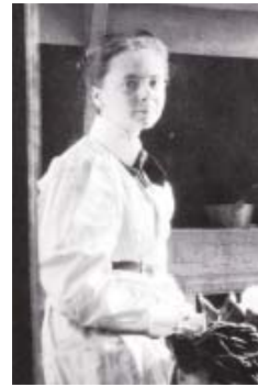
Julia Morgan in Paris, 1899