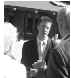
After-Meeting Discussions with a Speaker