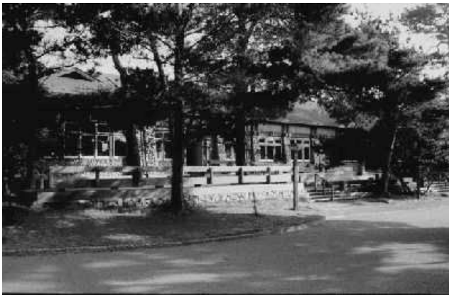
Crocker Dining Hall – Asilomar