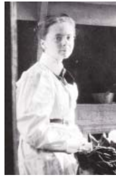
Julia Morgan in Paris, 1899