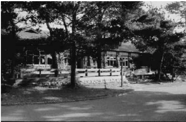
Crocker Dining Hall – Asilomar