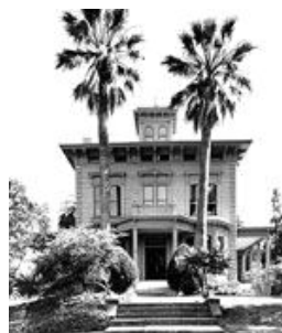
John Muir Home