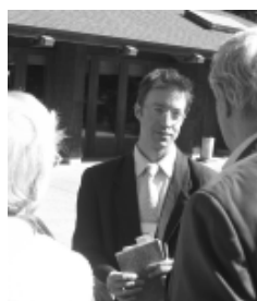
After-Meeting Discussions with a Speaker